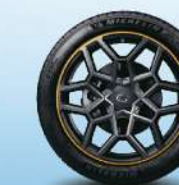
19-inch wheel hub + 235/45 R19 tyre (optional)