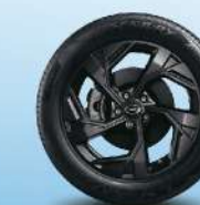
18-inch wheel hub + 225/55 R18 tyre